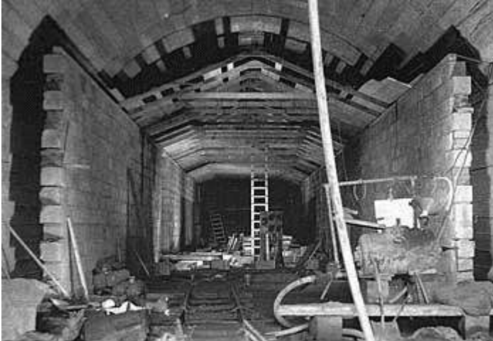
Construction of one of the cable station tunnels ca. 1940.

By 1870 a cable had been laid from England to Bombay, India. This was extended on to Australia in 1872. The English end was terminated at a cove close to Lands End in the village of Porthcurno, where a cable station was set up. The firms involved in this venture merged to form the Eastern Telegraph Company.