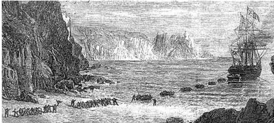
The landing of the first cable at Pothcurno in 1870.

The first site I visited was the home of the world's largest submarine telegraph station. This is now a unique historical telegraph museum buried deep in tunnels carved into granite cliffs, giving it a sort of