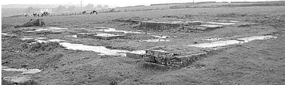
Foundations of the Poldhu wireless station.

What Maskelyne discovered was the lack of privacy associated with wireless transmissions, the lack of