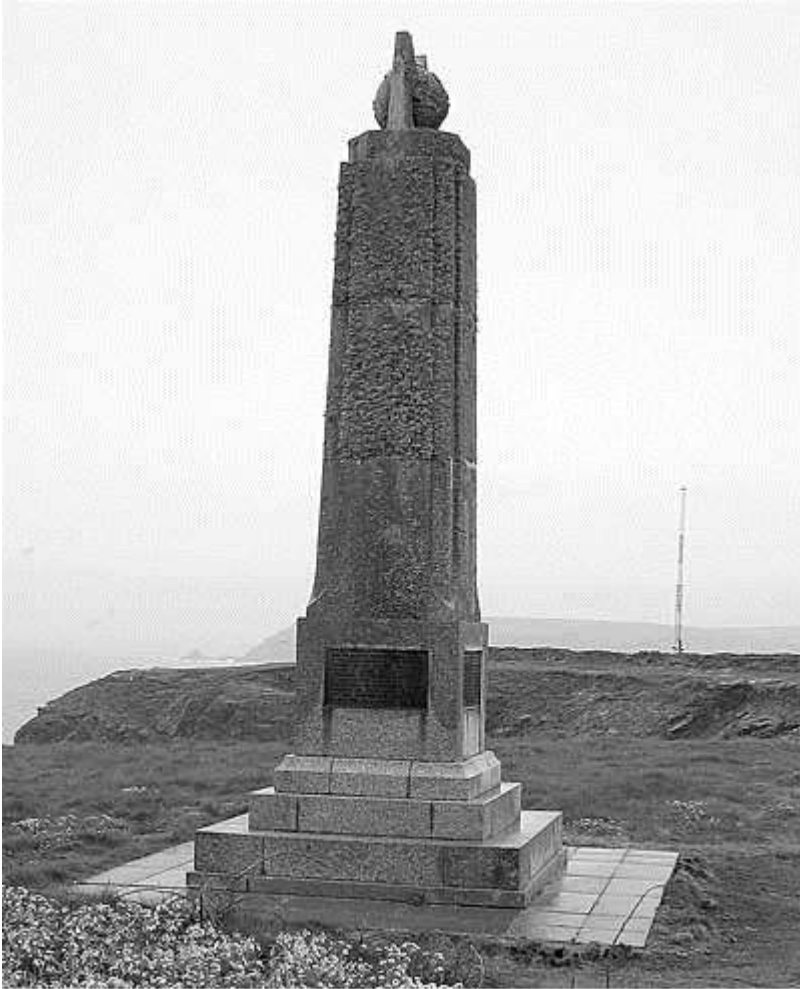
Tower commemorating Marconi's work at Poldhu.

In September of 1901, a gale toppled the massive aerial array at Poldhu. A few weeks later the masts at Cape Cod met the same fate. It was a devastating blow. Working furiously, the debris was cleared at the Poldhu site and a smaller and simpler fan array supported by two poles was constructed. Marconi modified his plans and decided to try for a transatlantic transmission over the shorter distance to Newfoundland rather than to Cape Cod.